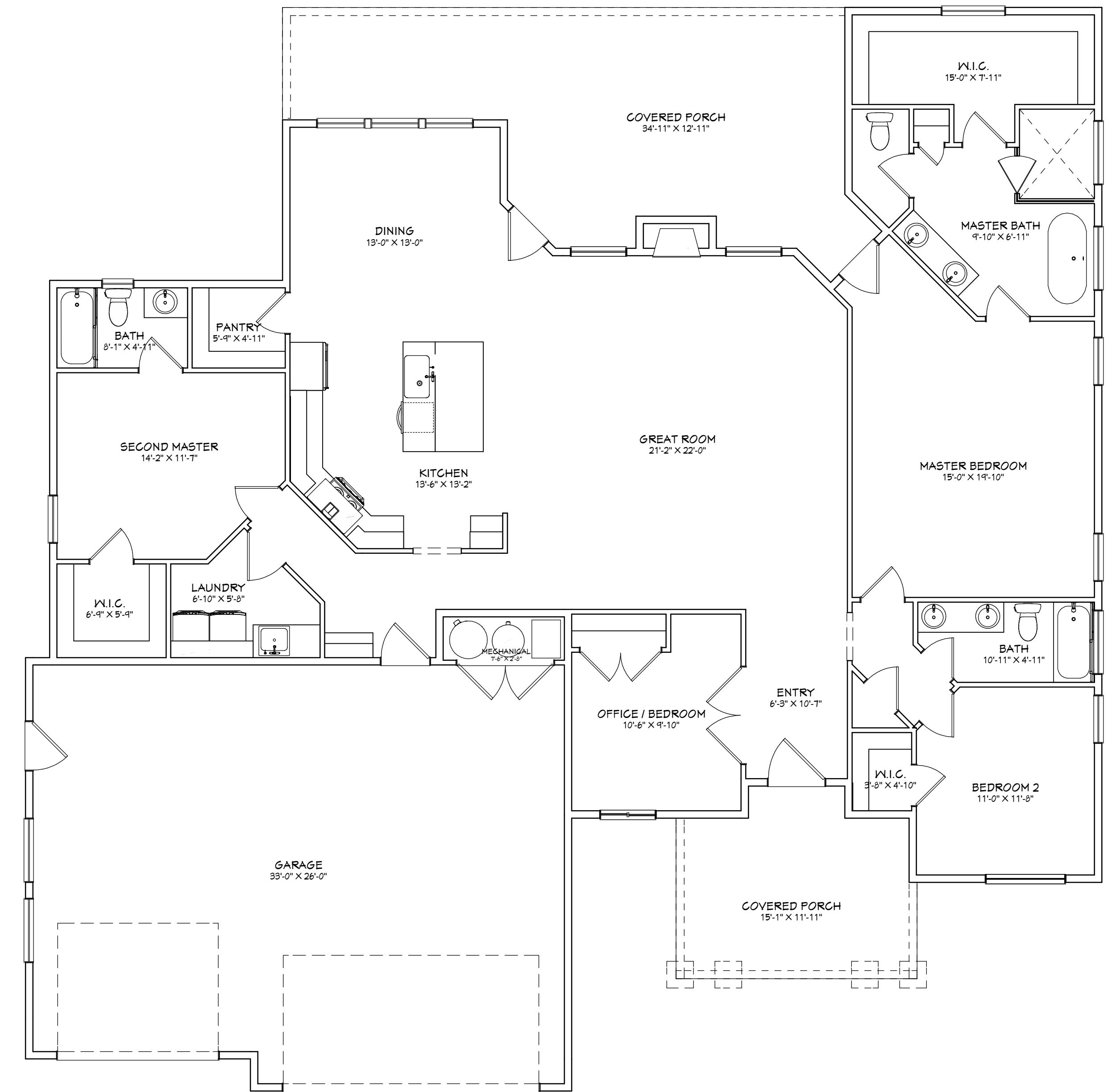
MAIN 2361 SQ. FT.