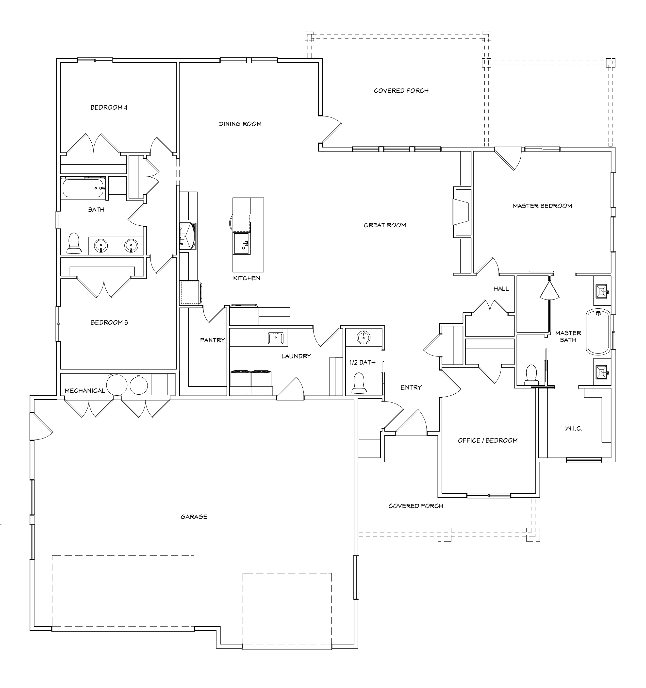
MAIN 2290 SQ. FT.